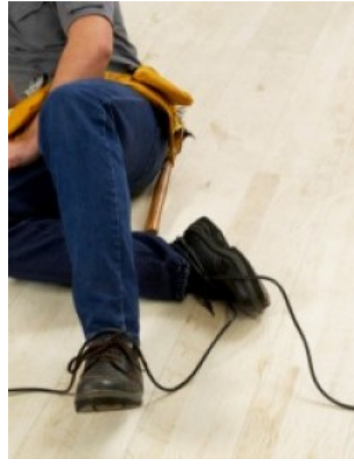
7. Untied shoe laces or failure to wear the right footwear

6. Wires and cords strung along the floor